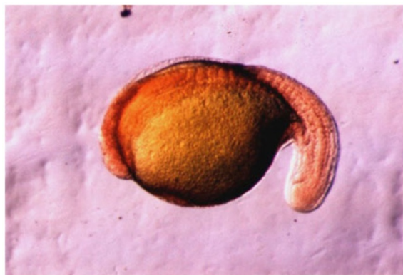
Figure 2 Haploid syndrome in H. fossilis .

Chromosome analysis of normal larvae from the control group indicated a modal chromosome number of 58. In contrast, abnormal larvae from the 2,500 to 7,500 \text{erg}/\text{mm}^2 group did not have a clear modal number but showed a range of 29 to 58 chromosomes. Furthermore, chromosome fragments were also observed in the metaphase spreads. A clear modal chromosome number of 29 was obtained above 12,500 \text{erg}/\text{mm}^2 . The frequencies of chromosome fragments decreased with increased UV dose. In the groups that receive more than 12,500 \text{erg}/\text{mm}^2 , the chromosome number was clearly haploid without any chromosome fragment.