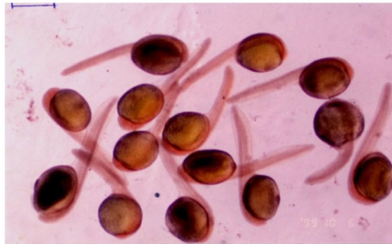
Figure 1 Normal diploid control H. fossilis .

irradiation of 2,500 to 7,500 \text{erg}/\text{mm}^2 than those with a higher dosage of UV irradiation ( <10,000 \text{ erg}/\text{mm}^2 ; Table 1).